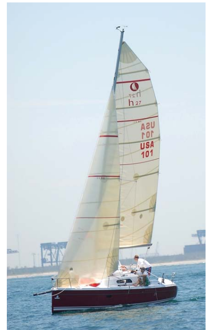
Laminate sails shown not provided with boat

White Hull w/ graphics Fixed Marine Head w/Holding tank Shore Power System & 30 amp Battery Charger Shipping Cradle