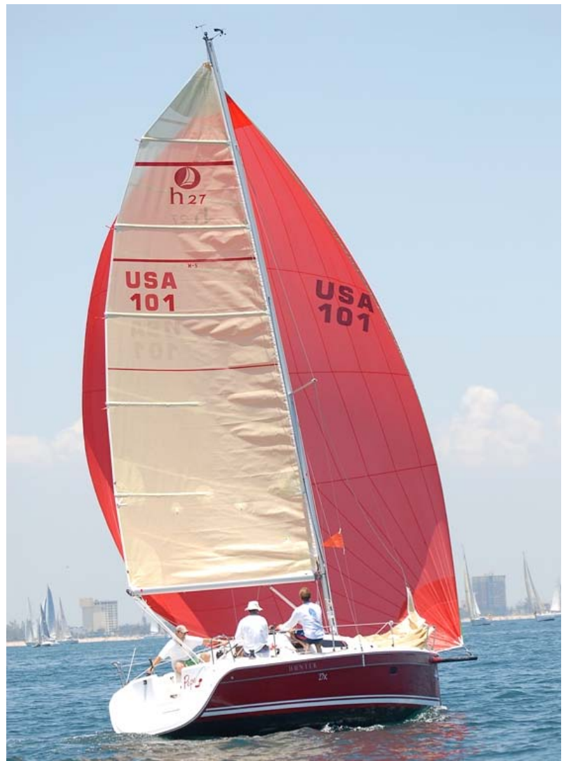
Masthead spinnaker shown not provided with boat

Preliminary Information. Subject to change without notice